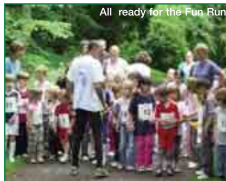
All ready for the Fun Run

The Community Woodland Forum was the first group to take advantage of the new Woodland Resource Centre. Eleven community woodlands were