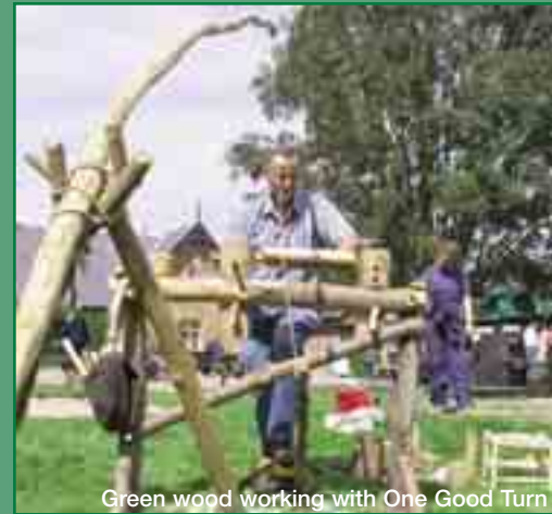
Green wood working with One Good Turn

A Tree Quiz set out around the courtyard tested the children's knowledge about trees and woodlands. More than 60 children took part in the quiz winning a choice of a rowan tree courtesy of Cheviot Trees, a wooden medal or pack of Tree Trump cards thanks to the Forestry Commission Scotland.