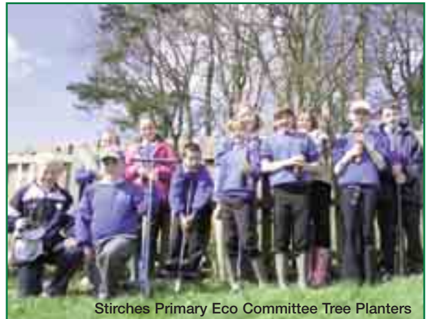
Stirches Primary Eco Committee Tree Planters

At Lilliesleaf, parents and the Eco Schools committee have been busy developing a wildlife garden. They have re-surfaced the path, re-instated a wetland area and planted bulbs, wildflowers, trees and shrubs. In June, BFT worked with the pupils on the Eco-committee to