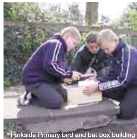
Parkside Primary bird and bat box building