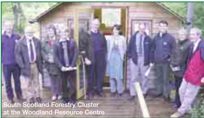
South Scotland Forestry Cluster at the Woodland Resource Centre

The Woodland Resource Centre is now open for public and group use and has accommodated many meetings including the South Scotland Forestry cluster. To book the room or use resources please contact the BFT office.