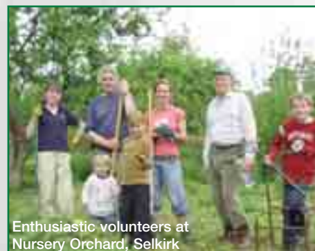
Enthusiastic volunteers at Nursery Orchard, Selkirk

Since the launch of the project the Orchard Development Group have formed and their aim is to carry on the work of BFT through volunteer days and active orchard management.