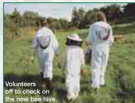
Volunteers off to check on the new bee hive.

The project has seen an array of community activities from Apple Day at Crailing Orchard to pruning workshops at Nursery Orchard in Selkirk. The project paid for four volunteers to attend a beekeeping course to learn about the relationship between orchards and the honey making pollinators. It has also set up Crailing Community Orchard with its first hive. So you may be seeing BFT honey on the shelves soon!