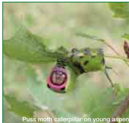
Puss moth caterpillar on young aspen