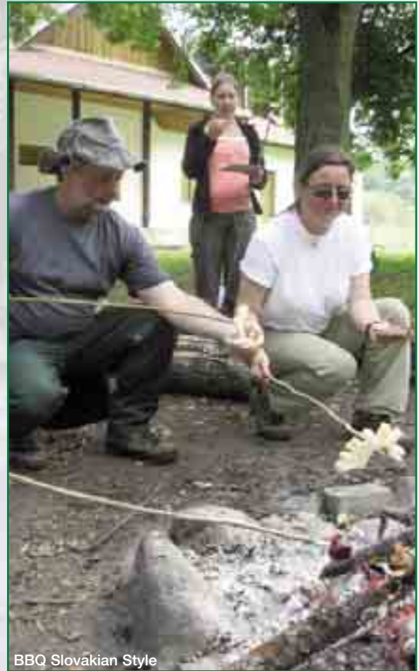
BBQ Slovakian Style

Throughout our travels it became apparent that although the two countries are geographically close and work in partnership on a variety of different projects there are fundamental differences. The Hungarians still have very strong connections with the environment, e.g. timber construction, coppicing, charcoal production, honey and fungi collecting, profusions of fruit trees and orchards and a seemingly inbuilt knowledge of the medicinal and purposeful uses of native plants. There is also a very strong emphasis on the environment within the curriculum, with most children having the opportunity to attend state funded Forest Schools. In Slovakia things are different. The people have very little