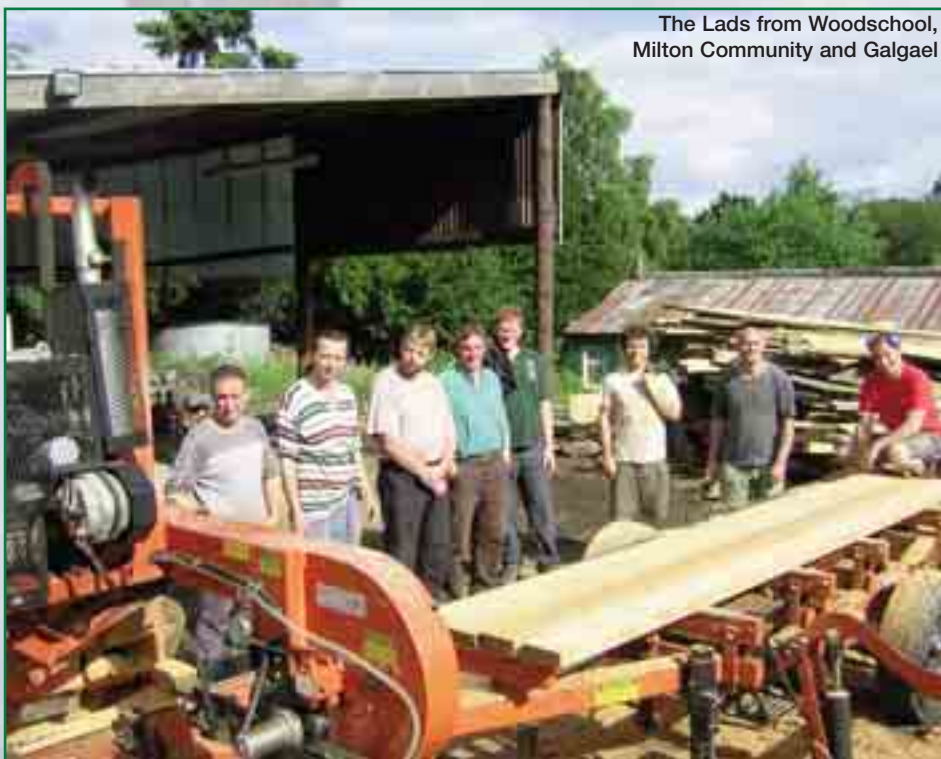
The Lads from Woodschool, Milton Community and Galgael