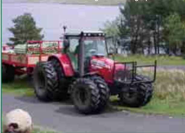
The tractor hard at work at Glengaber and Linghope

Chasing out marauding sheep has also been a feature of the summer work this year. Not exactly what we would choose to spend our time doing but at least it keeps you warm and fit! Fences are breached from time to time so vigilance is always required. BFT are extremely grateful to our band of regular volunteers for their time and effort in boundary walking to check the fence lines at many of our projects.