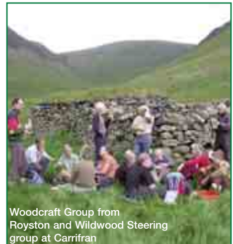
Woodcraft Group from Royston and Wildwood Steering group at Carrifran

In June we welcomed the Woodcraft Folk from Glasgow. This group of adults and kids were very keen to experience the Wildwood and camped overnight at Tibbie Sheils. Bracken was slashed and tree fertiliser applied, with only a few dropping by the wayside – probably due to the late-night campfire fun. It was good for our older (70 years plus) volunteers to meet the young teenagers and explain that they were going to be able to see an established wildwood, something which we older folk can only imagine.