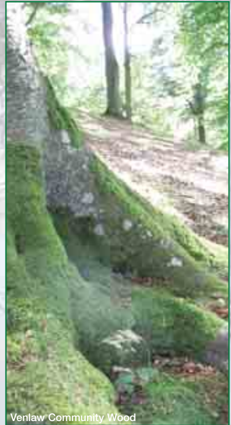
Venlaw Community Wood