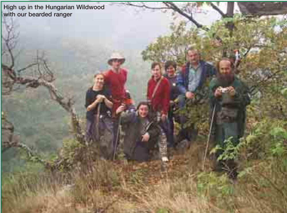
High up in the Hungarian Wildwood with our bearded ranger

This is where the work of the Ipel Union is invaluable. The Union is a cross-border organisation working towards conserving the remaining natural areas of the otherwise canalised Ipel River watershed. They are working to unite the two countries with this huge conservation project and are slowly, but surely, encouraging more interest in the environment. For example; their offices contain a teacher/student resource centre (to help teachers gain confidence and knowledge in teaching about the environment); they provide educational excursions for schools and visiting groups; they are developing green transport routes and cycle tracks throughout the area; they are also in the process of