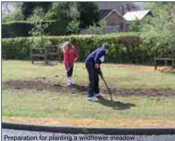
Preparation for planting a wildflower meadow