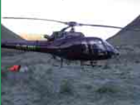
Moving supplies by helicopter at Carrifran, January 2007

Sadly, we lost our chief vole catcher in July. Jay, a Spaniel/Labrador cross was my shadow at Carrifran for the last 7 years and was always on the lookout for a tasty furry snack. On more than one occasion she would demonstrate this in front of groups of schoolchildren by sniffing out a nest of voles and making short work of them.