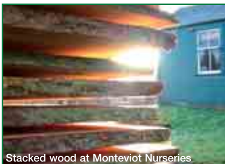
Stacked wood at Monteviot Nurseries