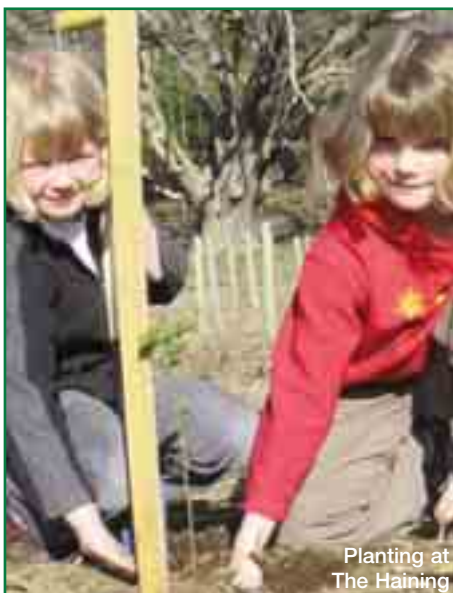
Planting at The Haining